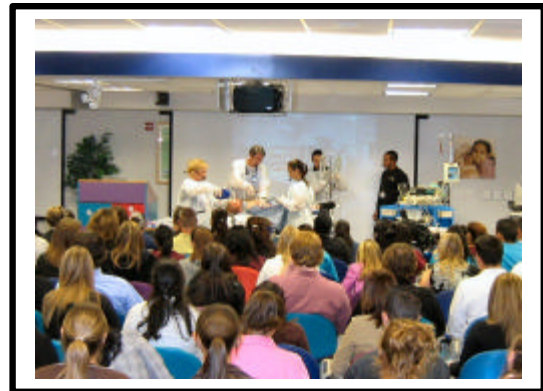
Students are engaged in the process