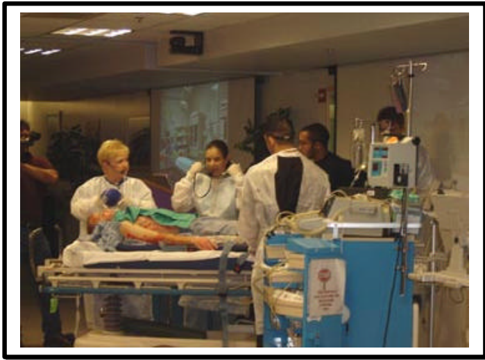
Attendees get a close up view of an emergency room.