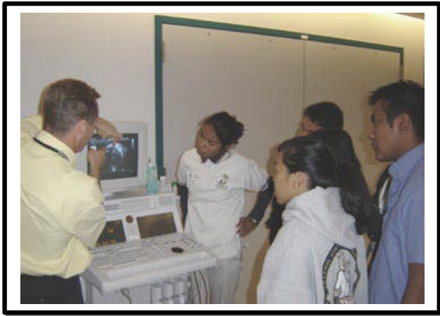
Students see a sonograph up close