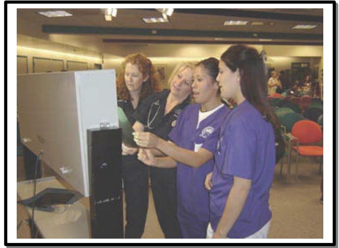
Hands on activities were available for the students to connect with the professionals

California Coalition for Nursing Careers Children's Hospital Kaiser Permanente