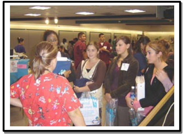
Students have an opportunity to ask one on one questions