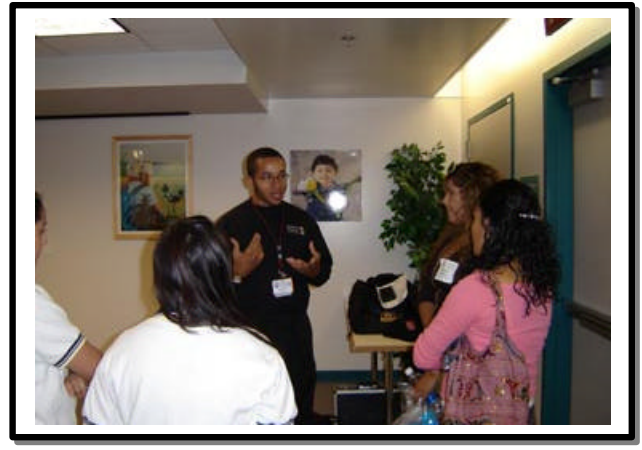
A student nurse tells his personal career story