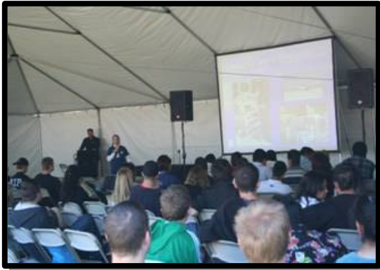
CHOC representatives were among the presenters who provided in-depth information about careers in their industry sector.