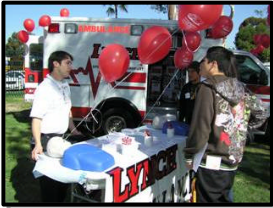
A Lynch Ambulance EMT connects with students about medical careers.