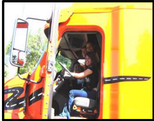
The view from the cab of a Schneider Truck big rig was great!