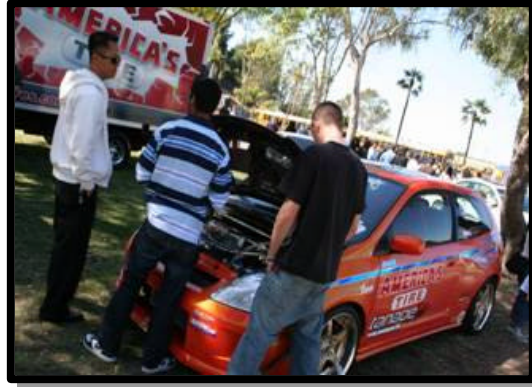
American Tire brought vehicles that caught the attention of the attendees.