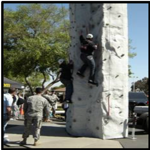
Two students test their climbing skills on the US Army rockwall.