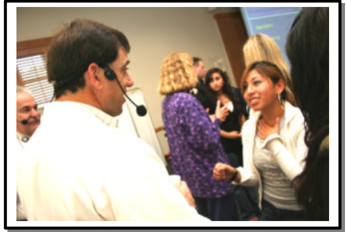
Students speak one on one with the ER physician.