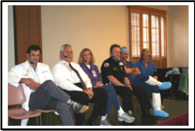
Presenters were recognized at the end of the reenactment and answered questions from the students.