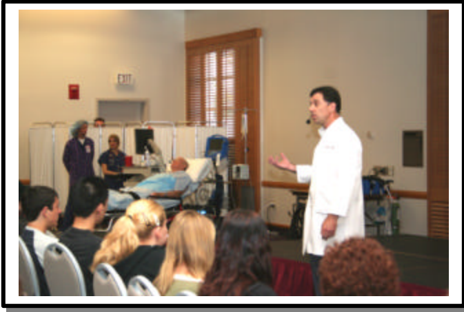
Job skills and career information were provided to the students by the medical staff.