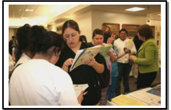
Colleges and ROPs provided information on post-secondary education in the medical field.